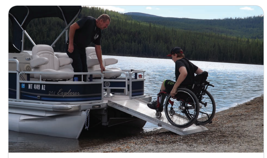
THE DISHON-SHORE-S-EZ PONTOON BOAT RAMP. Deploy the ramp and access the boat without assistance with the push of a button. Adjusts to almost any shoreline. www.dishonezdesign.com .